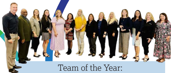
Team of the Year: Circuit 1 Child Protection Operations